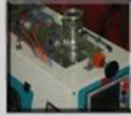
PLC Controlled Panumatic Product Input