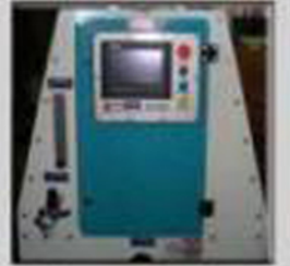
Touch Screen Control Panel