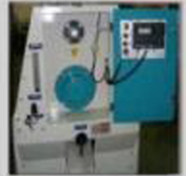
Safe Operative System

Ürün Kodu/Product Code /Код продукта QUINOA PE 508