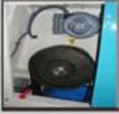
Drive Unit With Switch